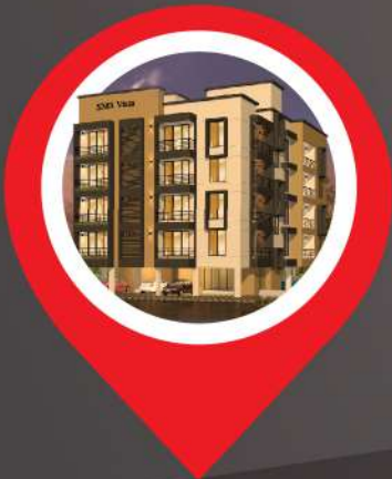
SMS Vista @ Edappally