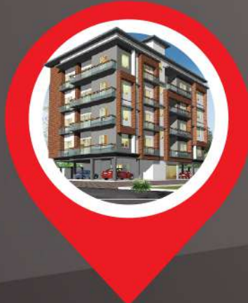
SMS Tejus @ Edappally