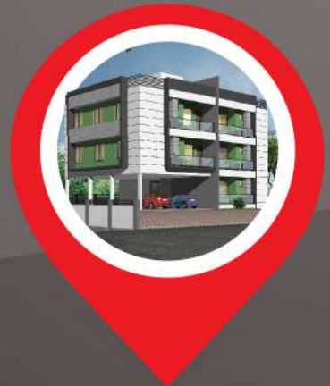
SMS Serenity-I @ Panampilly Nagar

SMS BUILDERS Making City Life Affordable