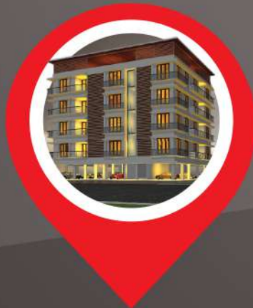
SMS Serenity-II @ Panampilly Nagar